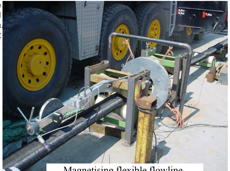
Magnetising flexible flowline

INNOVATUM presents it's latest magnetisation system, enabling passive tracking of power cables flexible flowlines, umbilicals and small diameter pipes at realistic ranges. Using a specially designed magnetiser tool, (shown in use at right), the magnetisation of the armour, strength members or the pipeline wall is significantly increased prior to product lay. This magnetisation may be carried out during manufacture, at cable loading to the lay vessel, or during the laying operation. The enhanced magnetisation is permanent, and the product can thus easily be located many years later. The increased magnetisation has no harmful effect on the product.